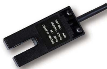
PI-06 Proximity sensor