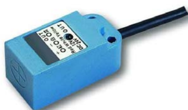
PX-01 Proximity sensor