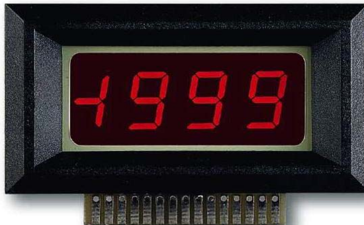
LED display with mounting bezel, Model : DP-40