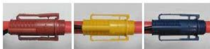
CP-6001-R RED CONNECTOR